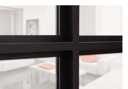
front view: relief

UNIQUE APPEARANCE THANKS TO A SLEEK DESIGN AND TAILOR MADE DOORS AND WALLS